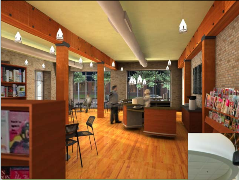
Suite A / B