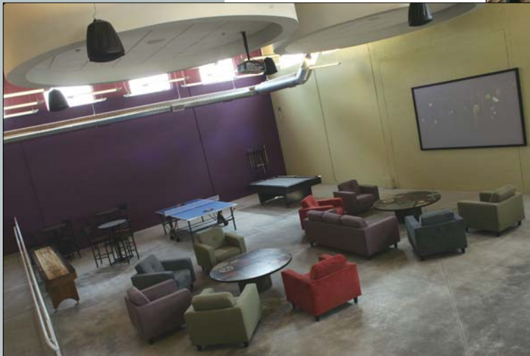
Suite C & Game Room